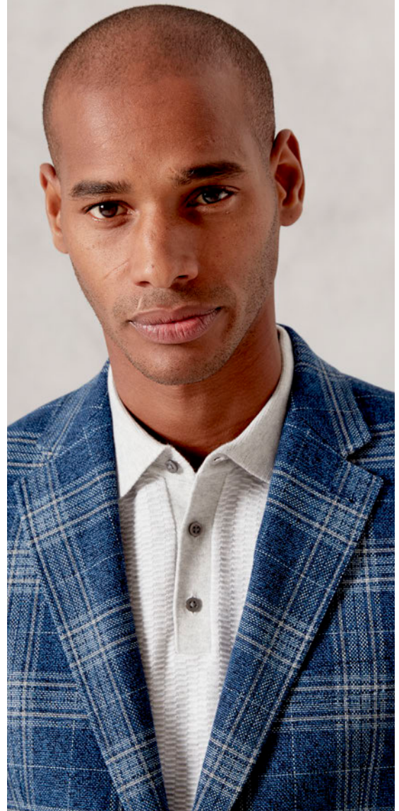
Kutcher navy check blazer