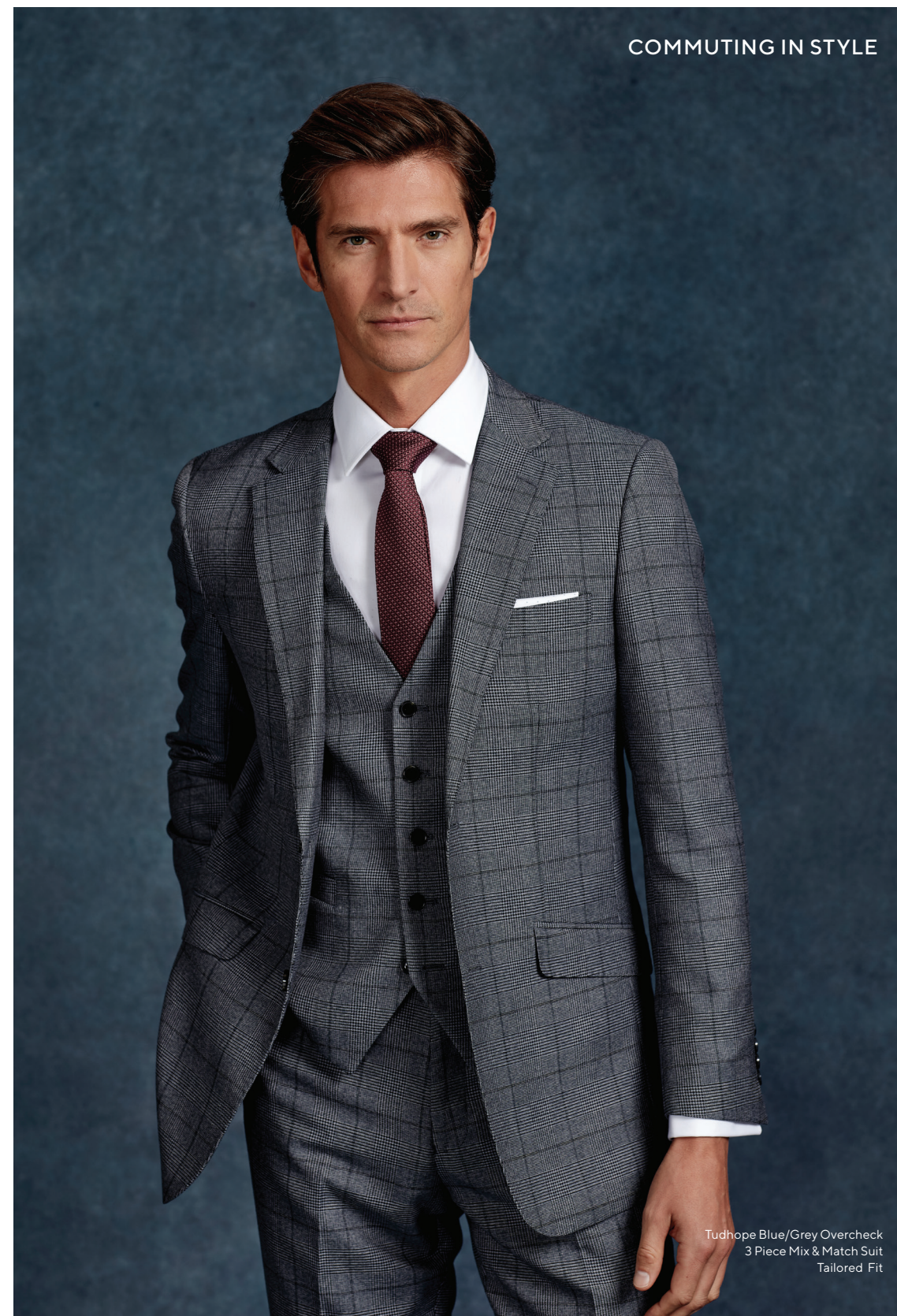
COMMUTING IN STYLE