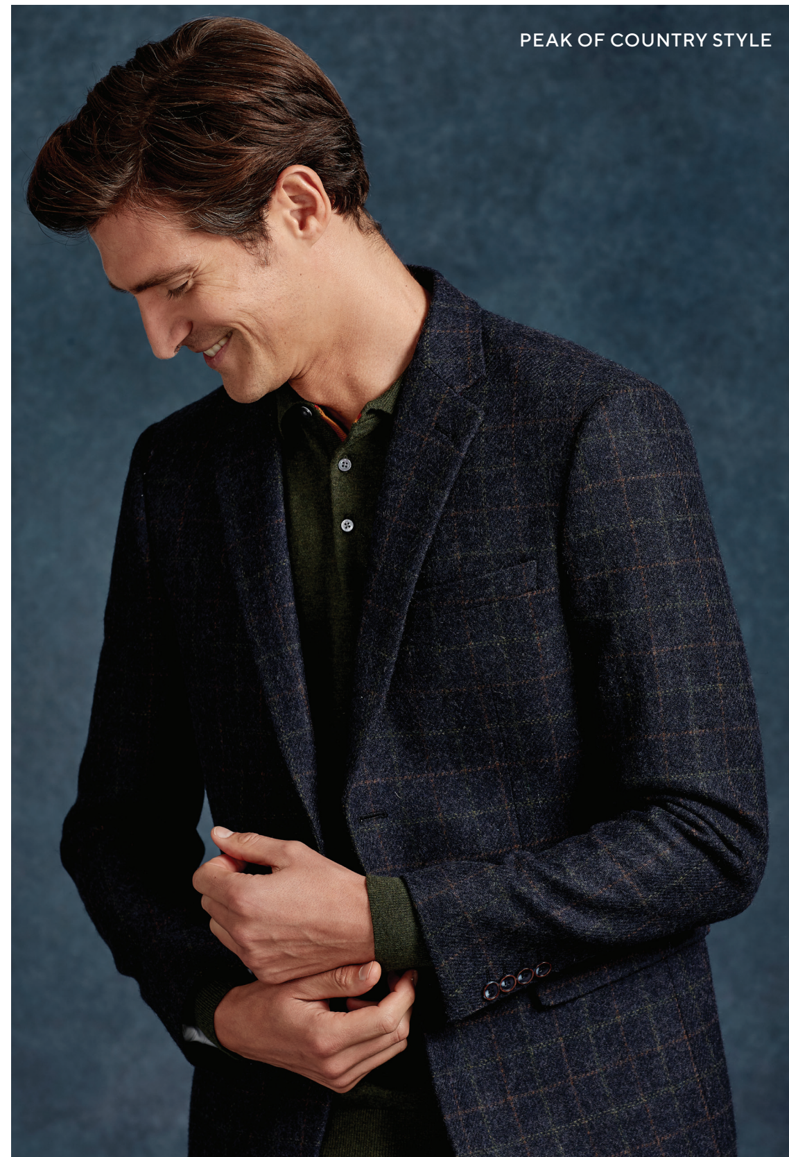
PEAK OF COUNTRY STYLE