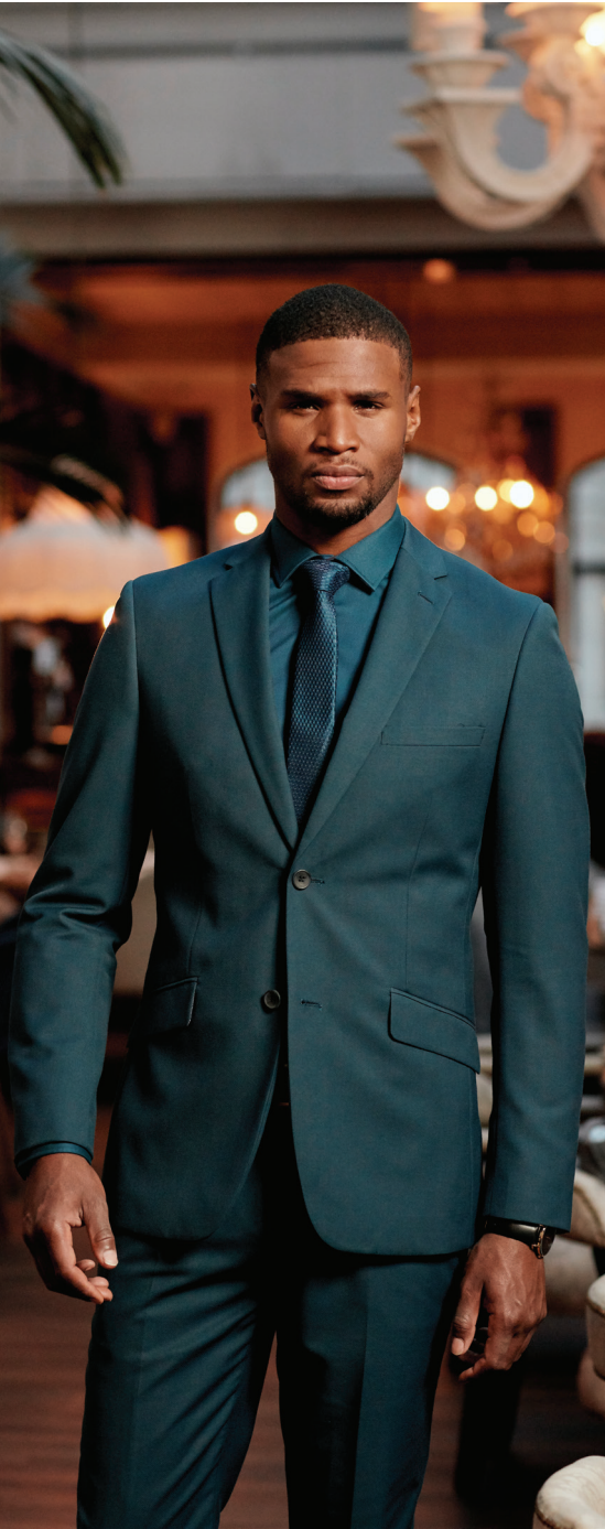
Sultano Teal 2 Piece Mix & Match Suit Slim Fit