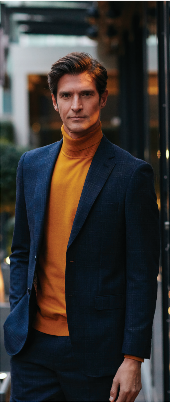
Momoa Navy Flannel Check Mix & Match Wool Blend Suit Tailored Fit Waistcoat Also Available