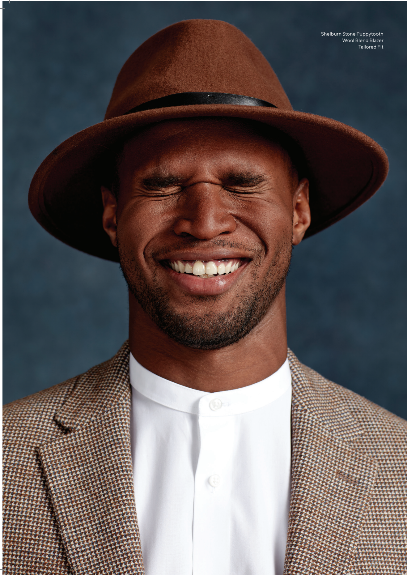
Shelburn Stone Puppytooth Wool Blend Blazer Tailored Fit