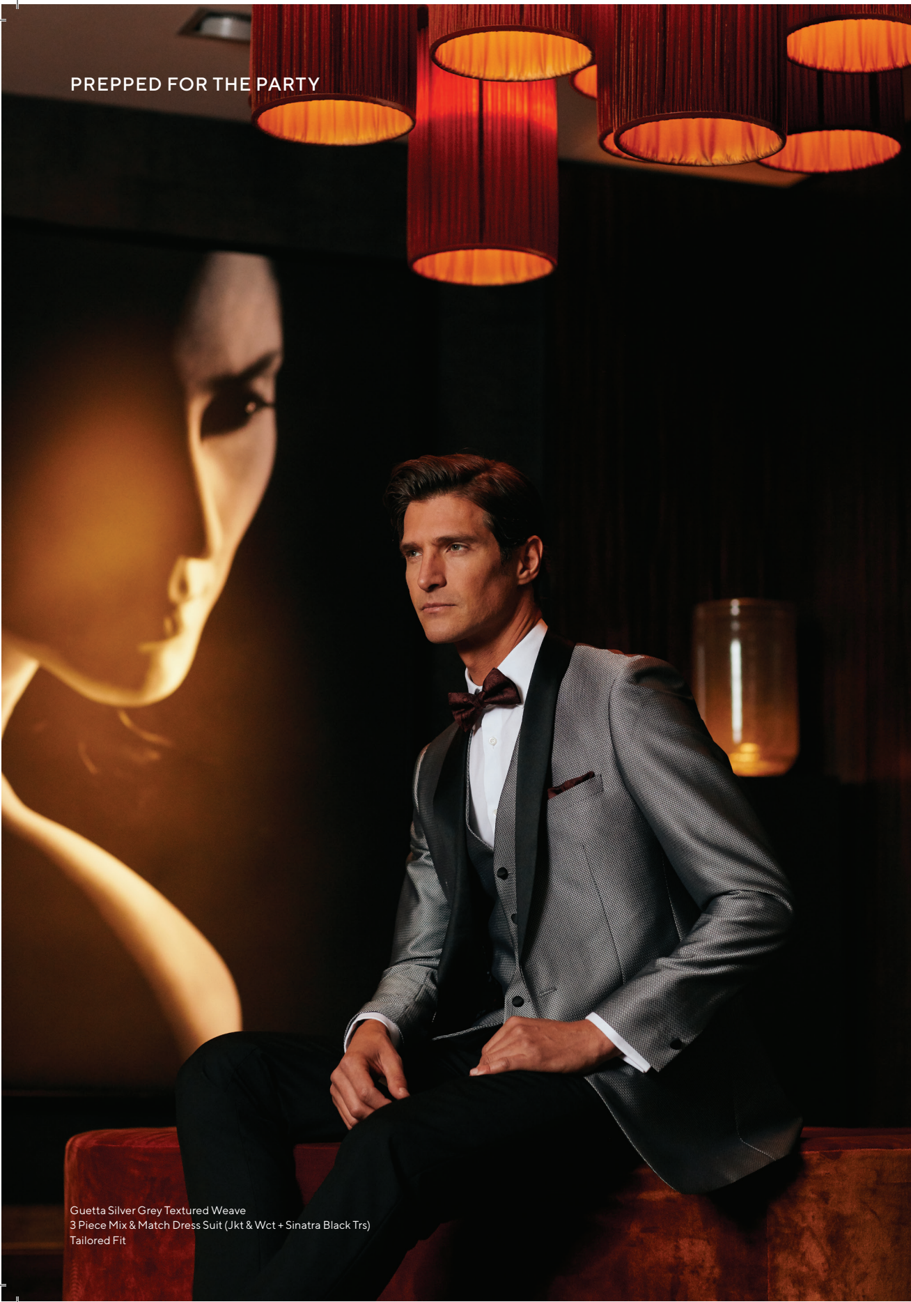
Guetta Silver Grey Textured Weave 3 Piece Mix & Match Dress Suit (Jkt & Wct + Sinatra Black Trs) Tailored Fit