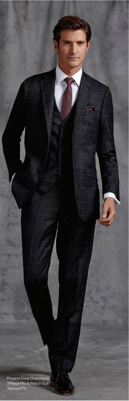
Pinsent Grey Overcheck 3 Piece Mix & Match Suit Tailored Fit