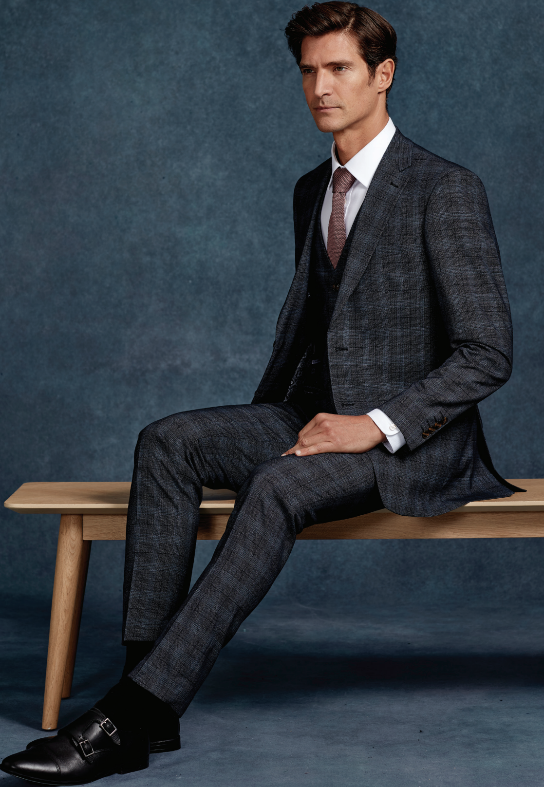
Suddard Grey Check 3 Piece Mix & Match Suit Tailored Fit