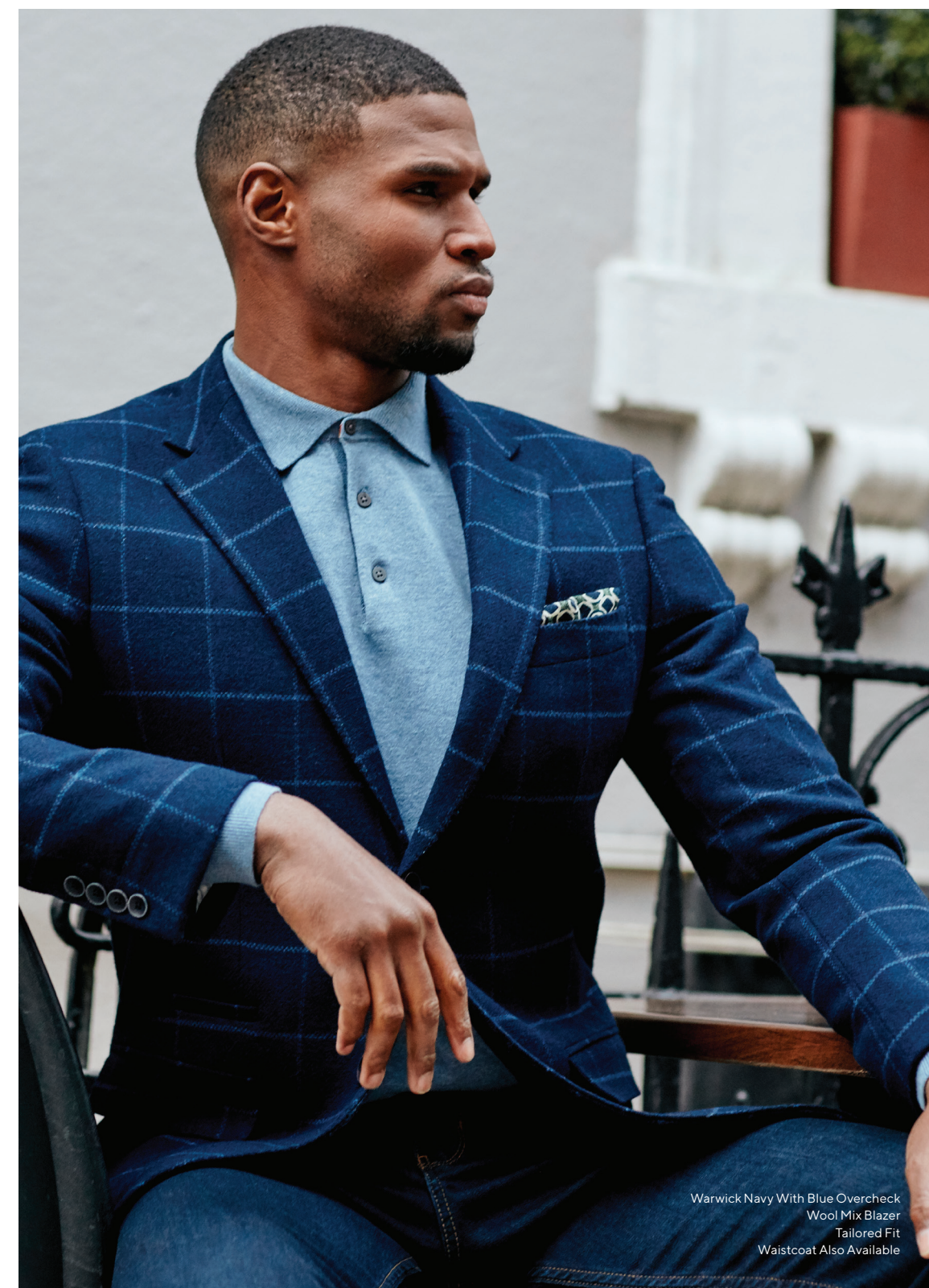
Warwick Navy With Blue Overcheck Wool Mix Blazer Tailored Fit Waistcoat Also Available