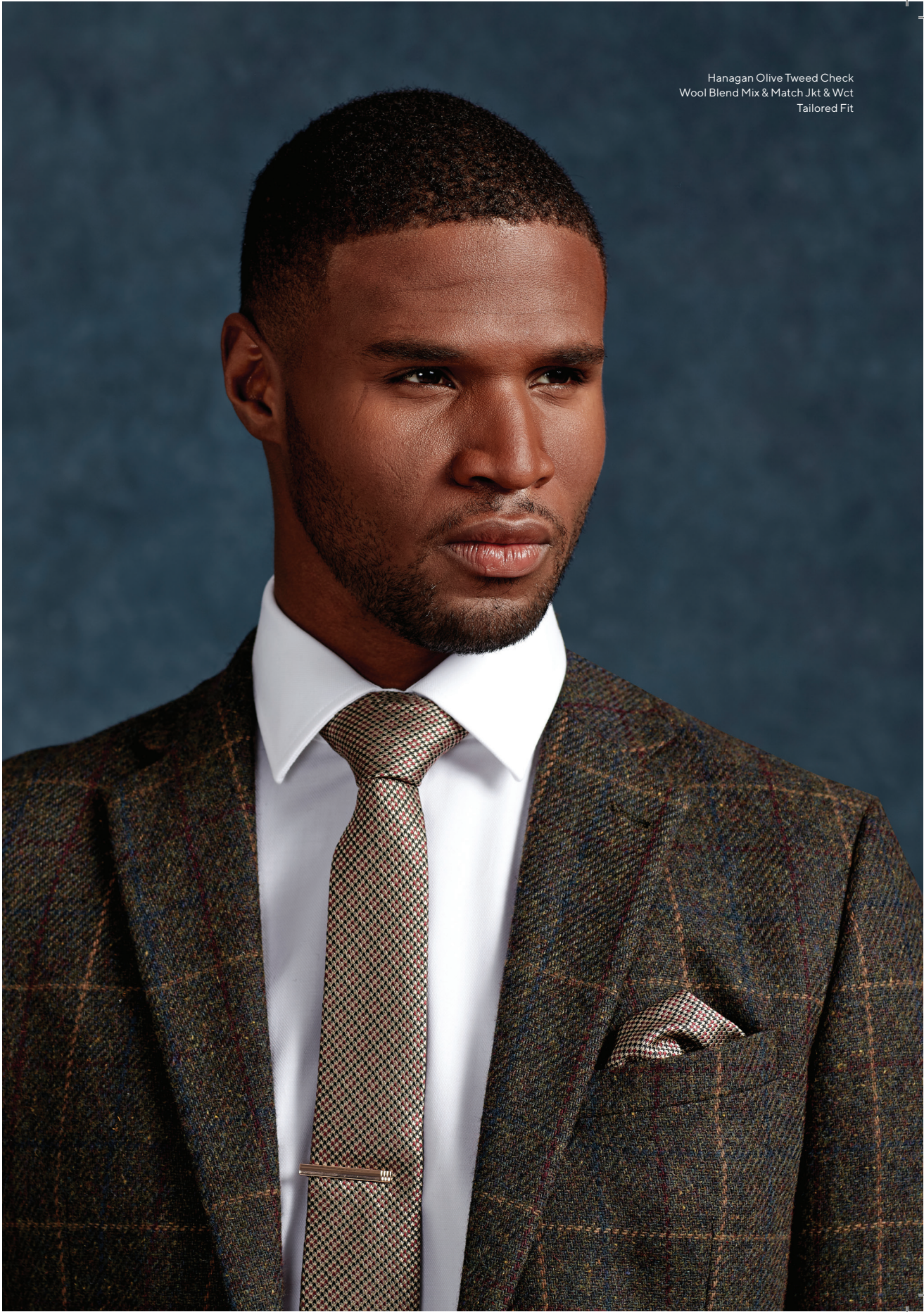
Hanagan Olive Tweed Check Wool Blend Mix & Match Jkt & Wct Tailored Fit