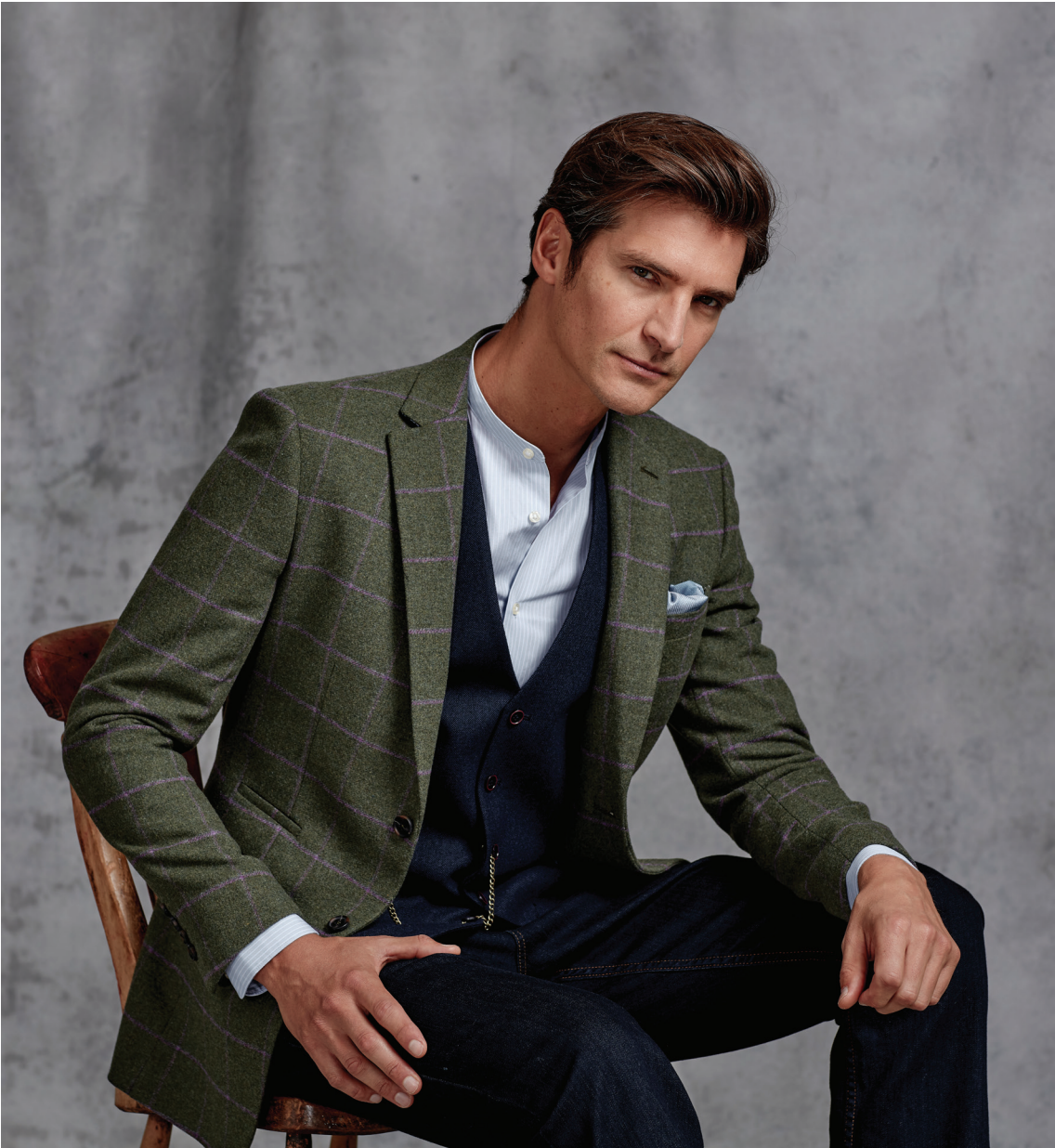
Crawley Olive/Lilac Check Jacket Chadwick Navy Tweed Waistcoat Wool Blend Mix & Match Jkt/Wcts Tailored Fit

Reach the peak of dapper with our country-inspired collection. These timeless styles are tailored with a nod to those Brummie rogues of days gone by. Come on, join the gang.