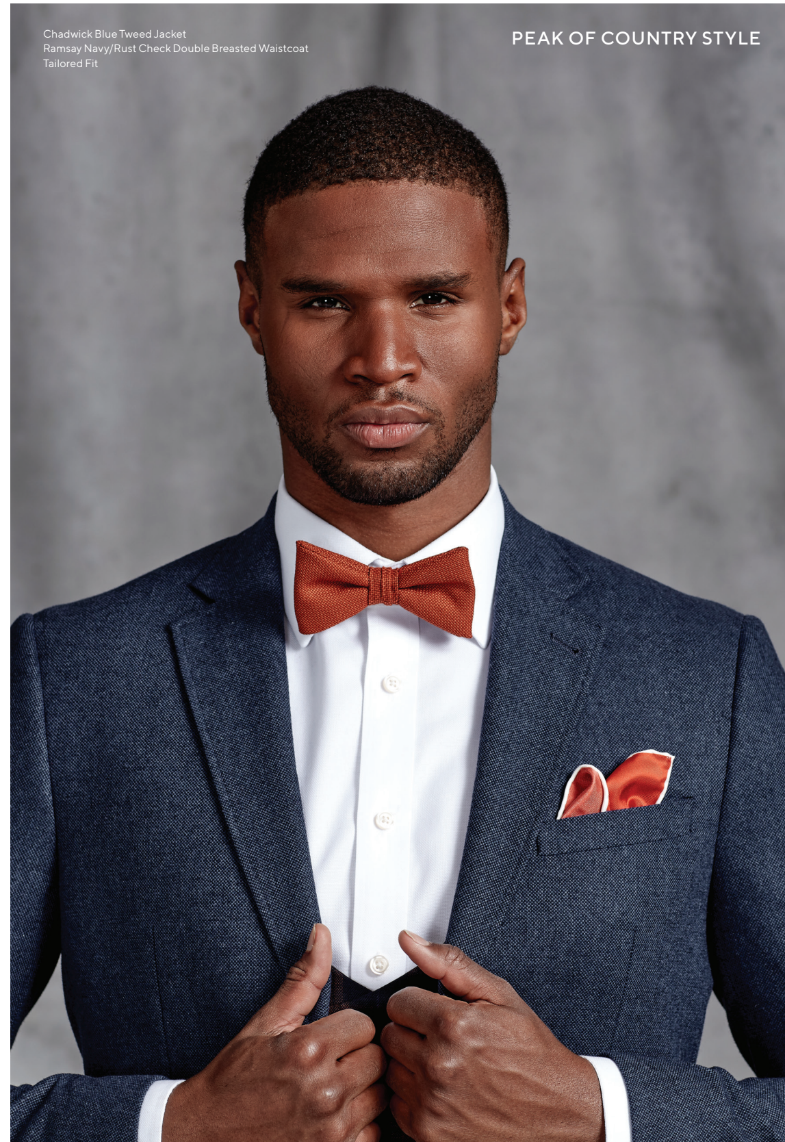
Chadwick Blue Tweed Jacket Ramsay Navy/Rust Check Double Breasted Waistcoat Tailored Fit