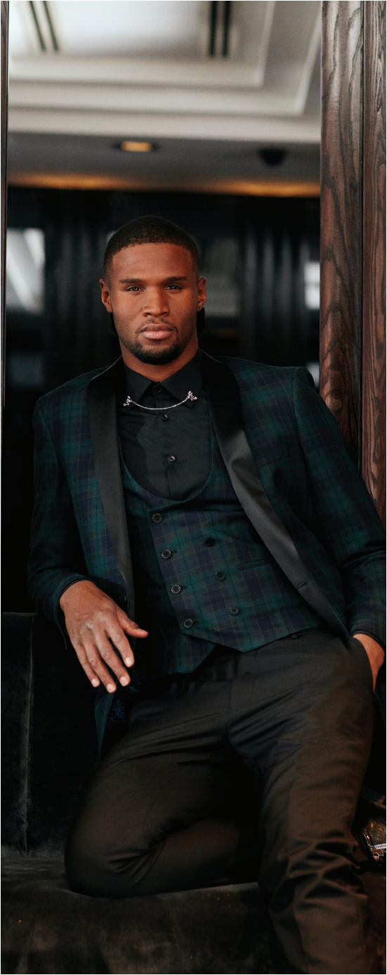
Sanchez Emerald Green Tartan 3 Piece Mix & Match Dress Suit (Jkt & Wct + Sinatra Black Trs) Tailored Fit