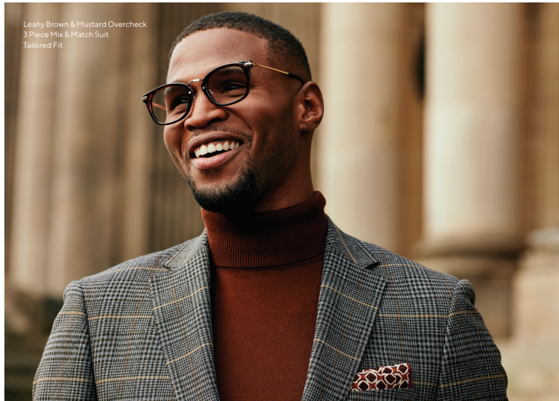
Leahy Brown & Mustard Overcheck 3 Piece Mix & Match Suit Tailored Fit