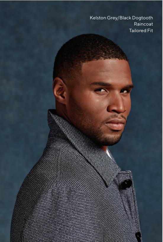
Kelston Grey/Black Dogtooth Raincoat Tailored Fit