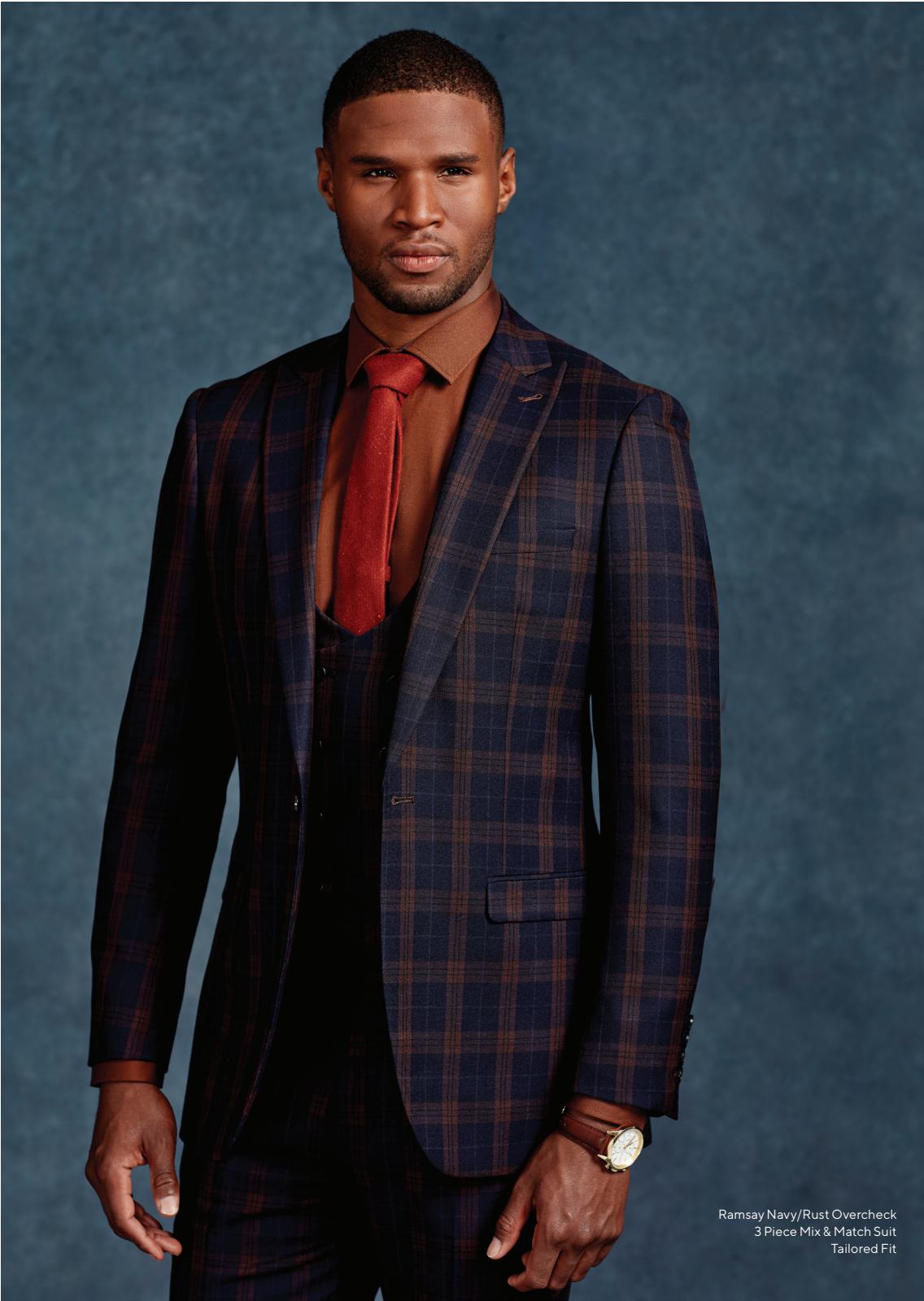
Ramsay Navy/Rust Overcheck 3 Piece Mix & Match Suit Tailored Fit