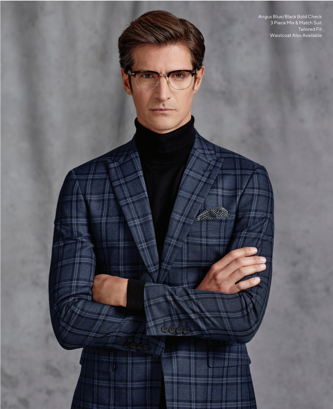
Angus Blue/Black Bold Check 3 Piece Mix & Match Suit Tailored Fit Waistcoat Also Available

Look effortlessly dapper without overdoing it by styling suits and blazers with more casual attire. This is laid back done well. No arguments there.