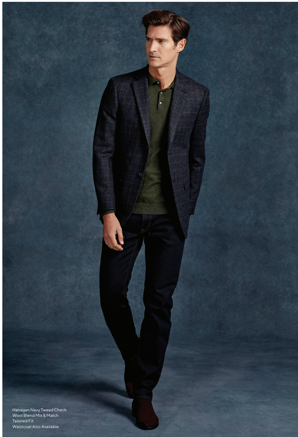
Hanagan Navy Tweed Check Wool Blend Mix & Match Tailored Fit Waistcoat Also Available