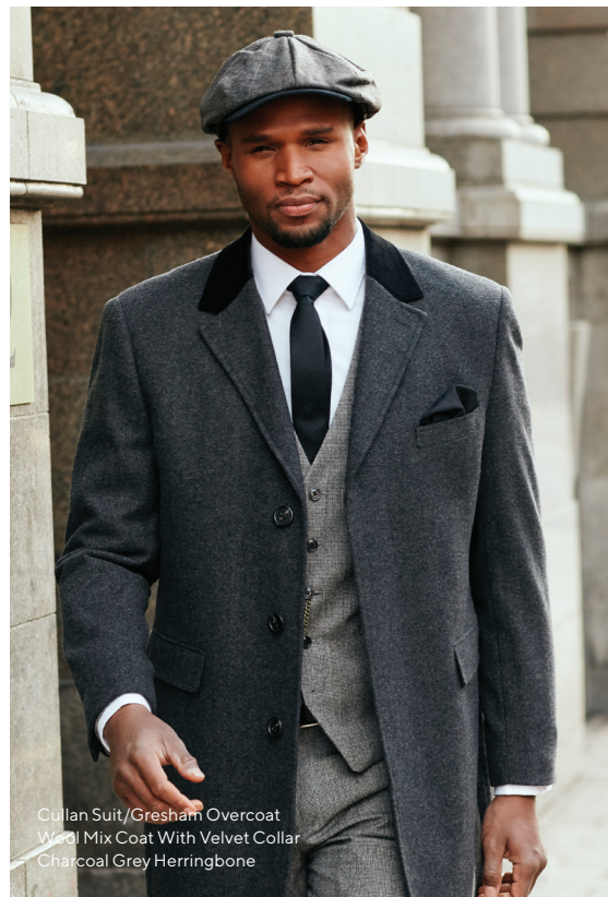
Cullan Suit/Gresham Overcoat Wool Mix Coat With Velvet Collar Charcoal Grey Herringbone