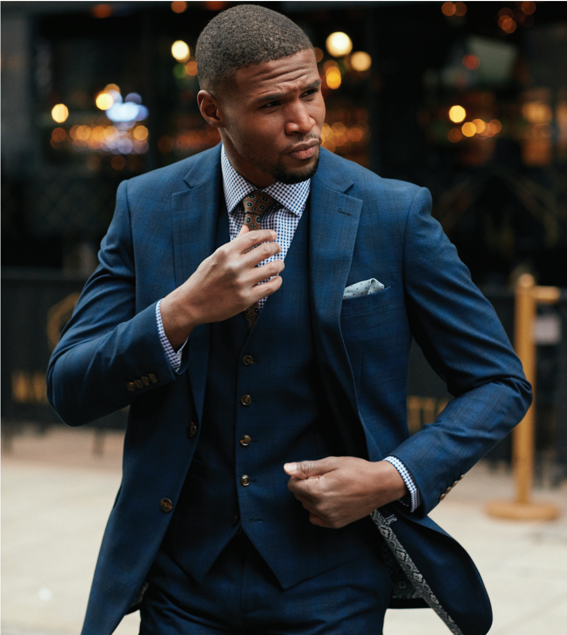
Suddard Navy Blue Check 3 Piece Mix & Match Suit Tailored Fit

It's time to show you mean business. From interviews to appraisals, client meetings to long lunches, step out in a suit that'll have you feeling like a boss – whether you are one or not.