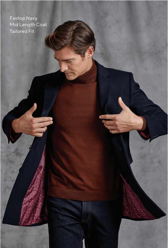
Fairlop Navy Mid Length Coat Tailored Fit