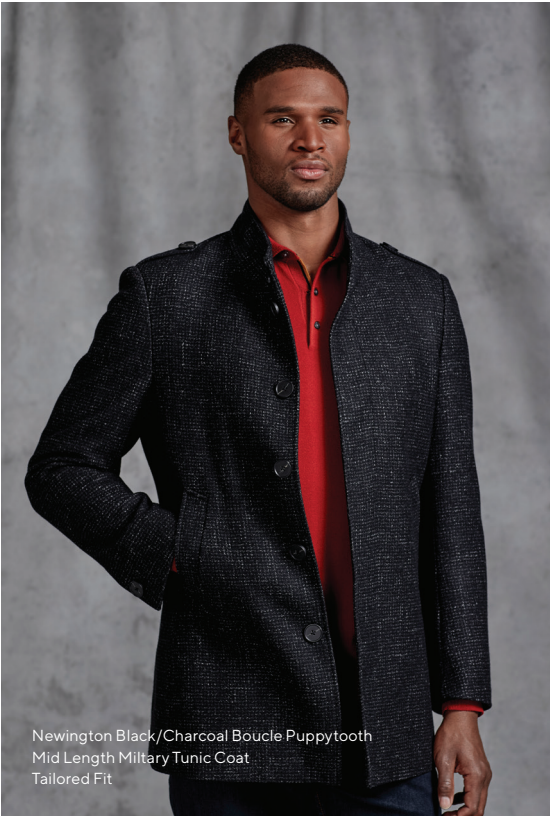
Newington Black/Charcoal Boucle Puppytooth Mid Length Military Tunic Coat Tailored Fit