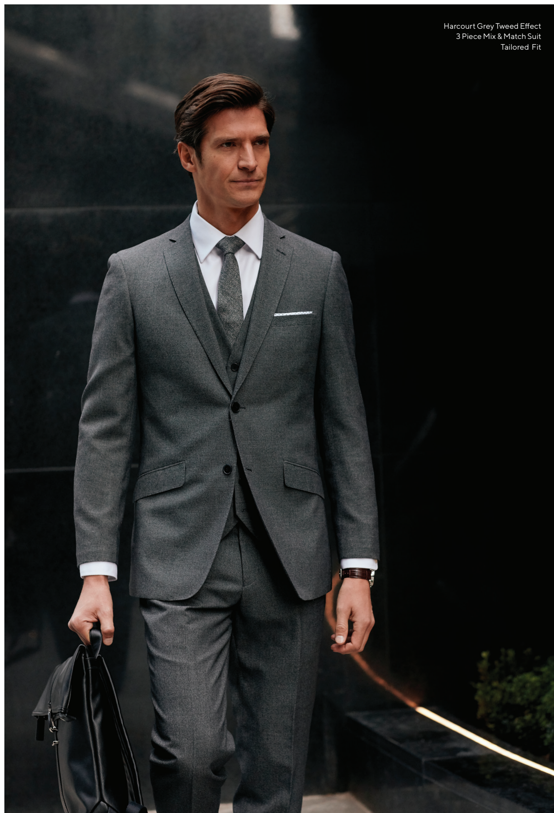
Harcourt Grey Tweed Effect 3 Piece Mix & Match Suit Tailored Fit