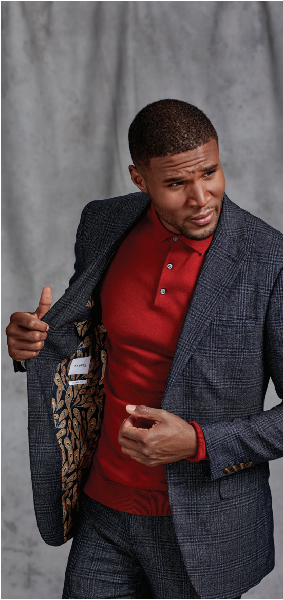
Woolf Blue/Rust Marl Check Mix & Match Suit Tailored Fit Waistcoat Also Available