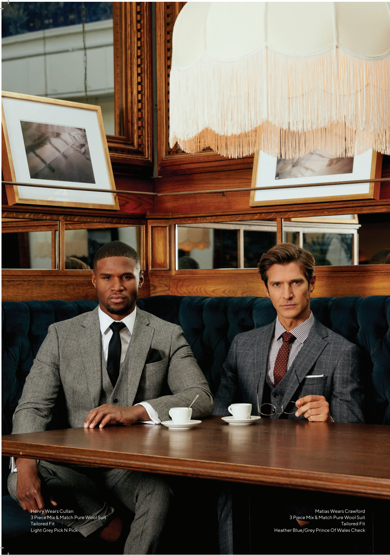
Henry Wears Cullan 3 Piece Mix & Match Pure Wool Suit Tailored Fit Light Grey Pick N Pick