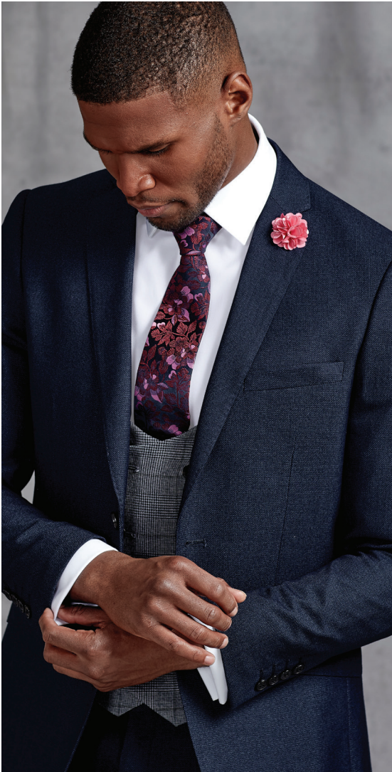
Harcourt/Tudhope - 3 Piece Suit Harcourt Navy Suit Worn With Tudhope Blue/Grey Overcheck Waistcoat.