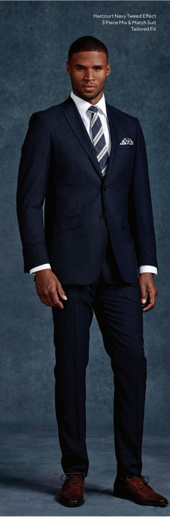
Harcourt Navy Tweed Effect 3 Piece Mix & Match Suit Tailored Fit