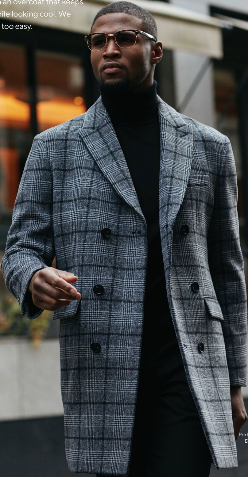
Porter Grey/Black Overcheck Double Breasted Overcoat Tailored Fit

Don't fall at the last hurdle. Top off any look with an overcoat that keeps you warm while looking cool. We make that all too easy.