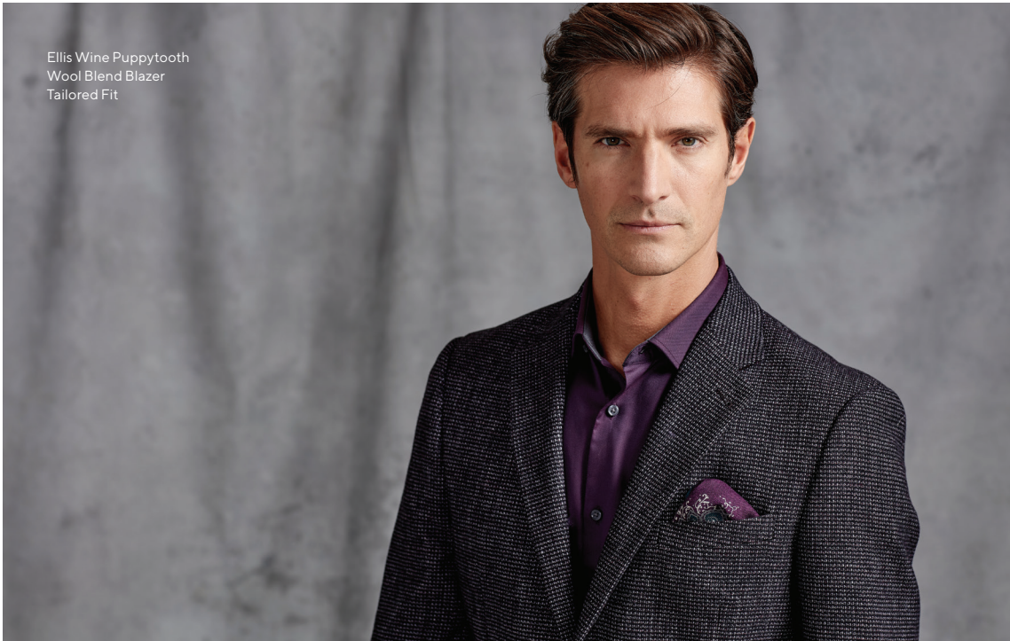
Ellis Wine Puppytooth Wool Blend Blazer Tailored Fit