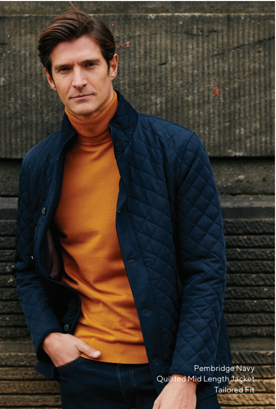
Pembridge Navy Quilted Mid Length Jacket Tailored Fit